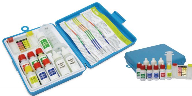
6-Way Test Kit K335CB Measures pH, chlorine / bromine, alkalinity, hardness & stabilizer.